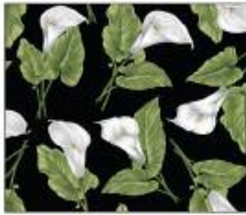
6784-12 CALLA LILY • BLACK/MULTI