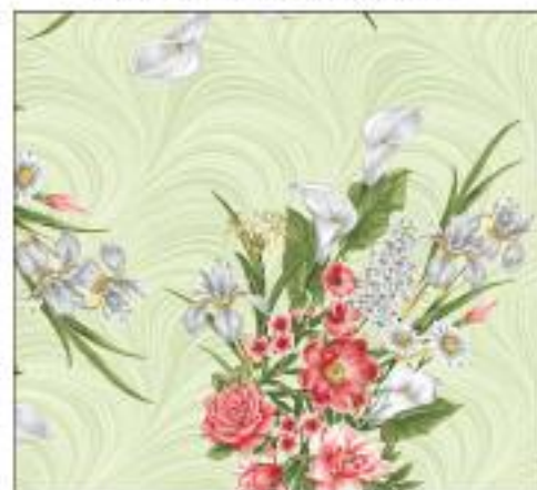
6782-40 • MAGNIFICENT BLOOM BOUQUET • SAGE