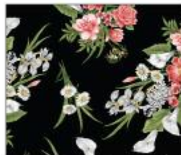
6788-12 • MAGNIFICENT BLOOM BOUQUET MED • BLACK/MULTI