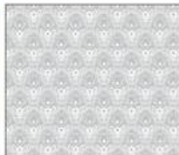
6787-08 NOUVEAU • LT GRAY