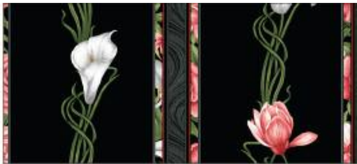
6781-12 • MAGNIFICENT BLOOM STRIPE • BLACK/MULTI