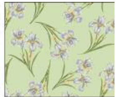
6783-40 IRIS • SAGE