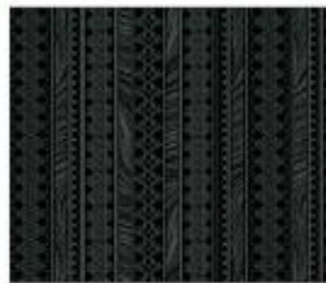
6786-12 NOUVEAU STRIPE • BLACK