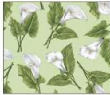
6784-40 CALLA LILY • SAGE