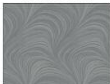
2966-14* WAVE TEXTURE • STEEL