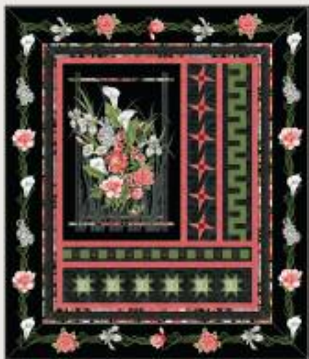
free pattern MY WINDOW BY JACKIE ROBINSON (51" X 50")

This is a collection that is really well named... its blooms are truly magnificent! The featured bloom is a delicate white calla lily, beautifully painted and surrounded by other colorful flowers. The focal print is a stunning calla lily panel, dramatically presented on a textured black background. Bouquets, calla lily allovers in varying scales, and a wonderful variety of textures, including a floral stripe, accompany the panel. Like all of Jackie's collections, these fabrics were designed to provide multiple design options, and Jackie has designed a fabulous selection of patterns to go with the collection. Truly magnificent!