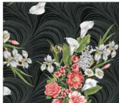
6782-12 • MAGNIFICENT BLOOM BOUQUET • BLACK/MULTI