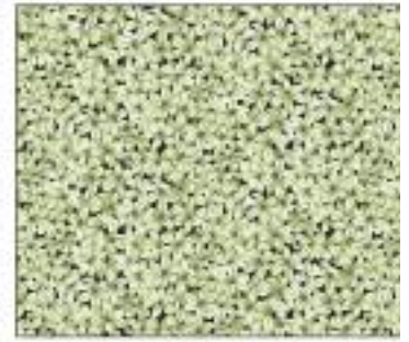
6785-40 HYACINTH PETALS • SAGE