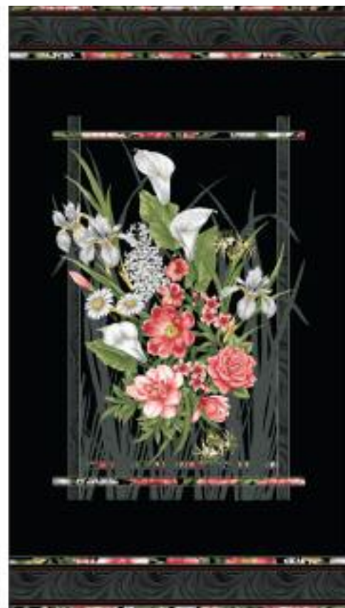
6780-12 • MAGNIFICENT BLOOM PANEL BLACK/MULTI (SHOWN REDUCED)