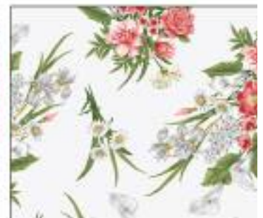
6788-13 • MAGNIFICENT BLOOM BOUQUET MED • CLOUD/MULTI