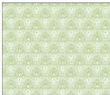
6787-04 NOUVEAU • LT SAGE