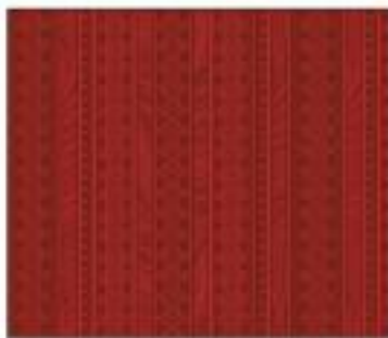
6786-10 NOUVEAU STRIPE • RED