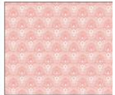
6787-01 NOUVEAU • LT PINK