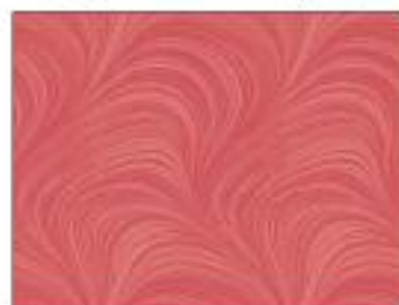
2966-21* WAVE TEXTURE • RASPBERRY