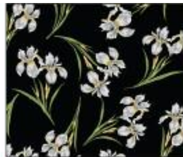
6783-12 IRIS • BLACK/SAGE