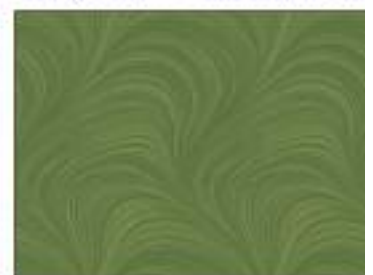
2966-46* WAVE TEXTURE • BASIL