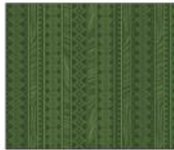
6786-44 NOUVEAU STRIPE • GREEN