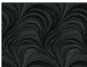
2966-12* WAVE TEXTURE • BLACK