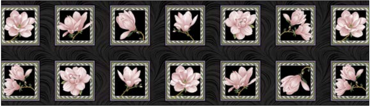
3616-20 • MAGNOLIA BLOOMS BLOCKS • CORAL/BLACK