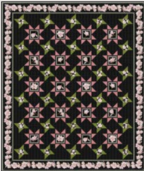
free pattern MAGNOLIA STARS BY JACKIE ROBINSON (56" X 68.5")

Jackie Robinson chose a magnificent flower to place on fabric... a magnolia! The lush full petals of the magnolia give this flower a soft, rich look, and the coloring... pale ivory or blush pink, is almost translucent. Mix it with some smaller floral allover and a striking magnolia stripe, and you have a collection that is just perfect for home decorating, quilting and apparel. It's simply beautiful! The magnolia is set on black fabric which gives it an especially sophisticated look. Be sure to look for Jackie's other collection, Classic Scrolls and Blenders. It will go perfectly with this stunning fabric group. Let's put an accent on Jackie Robinson!