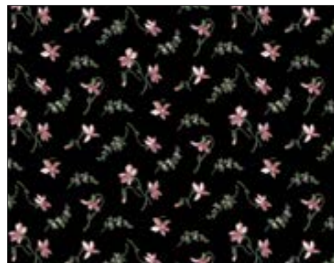
3619-20 PETITE MAGNOLIA CORAL/BLACK