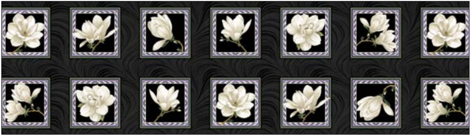
3616-07 • MAGNOLIA BLOOMS BLOCKS • CREAM/BLACK