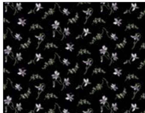
3619-66 PETITE MAGNOLIA PURPLE/BLACK