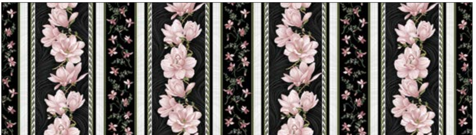
3617-20 • MAGNOLIA BLOOMS STRIPE • CORAL/BLACK