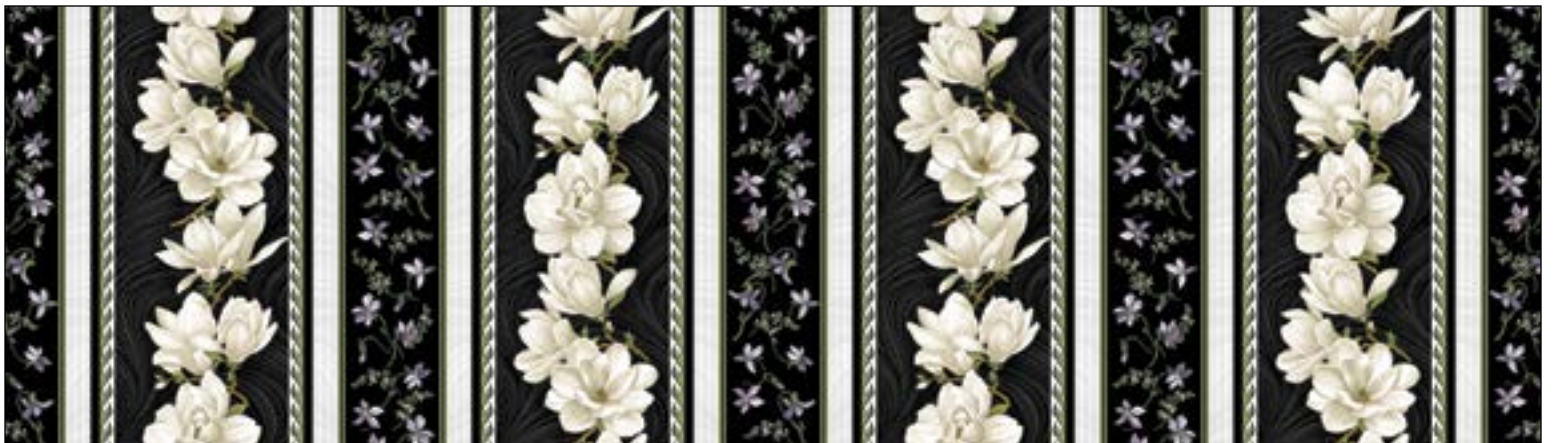
3617-07 • MAGNOLIA BLOOMS STRIPE • CREAM/BLACK