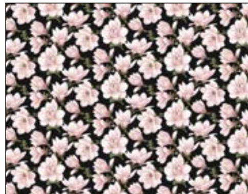
3618-20 MAGNOLIA BLOOMS ALLOVER CORAL/BLACK